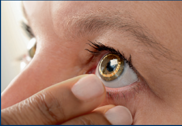
SENSIMED Triggerfish® Sensor in the eye.